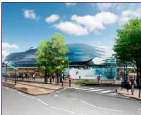
New Street Gateway - with 'Spanish' Steps